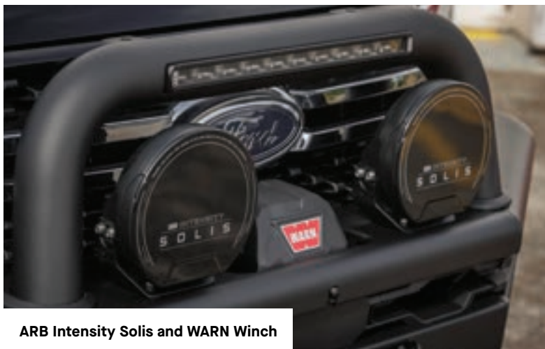
ARB Intensity Solis and WARN Winch