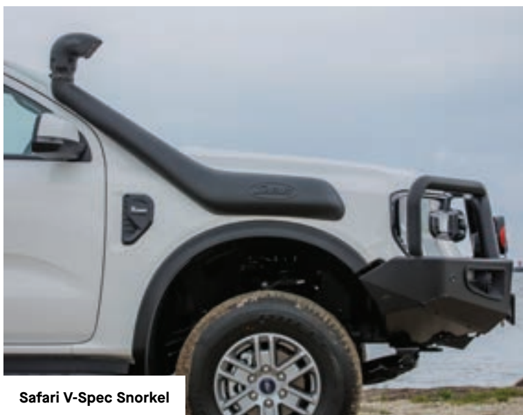
Safari V-Spec Snorkel