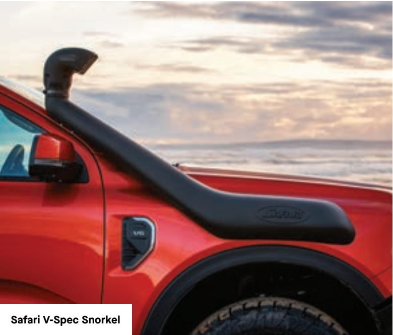
Safari V-Spec Snorkel