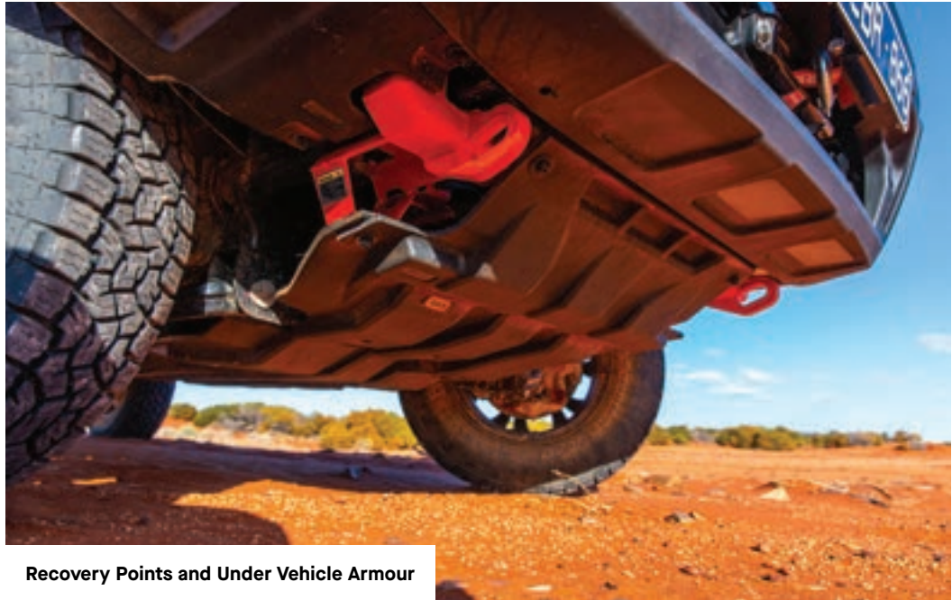
Recovery Points and Under Vehicle Armour