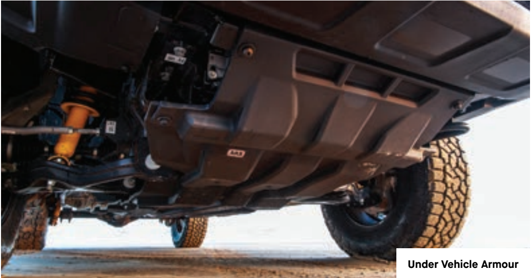
Under Vehicle Armour