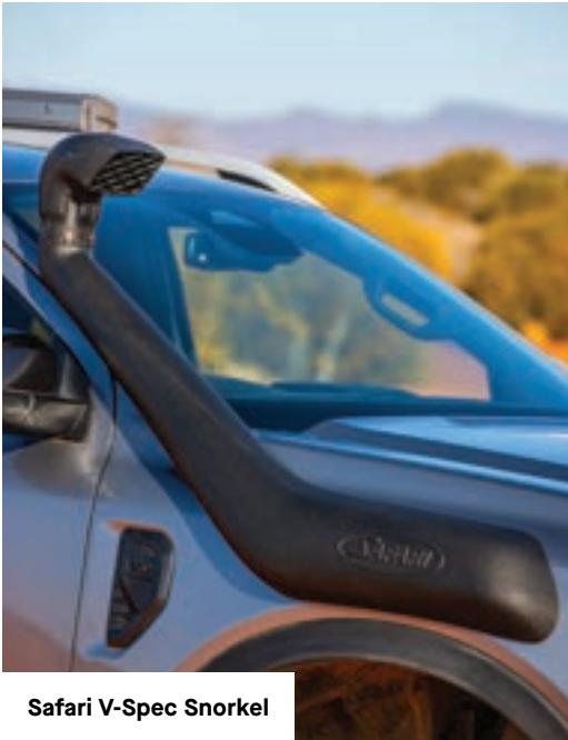
Safari V-Spec Snorkel