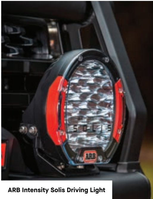
ARB Intensity Solis Driving Light