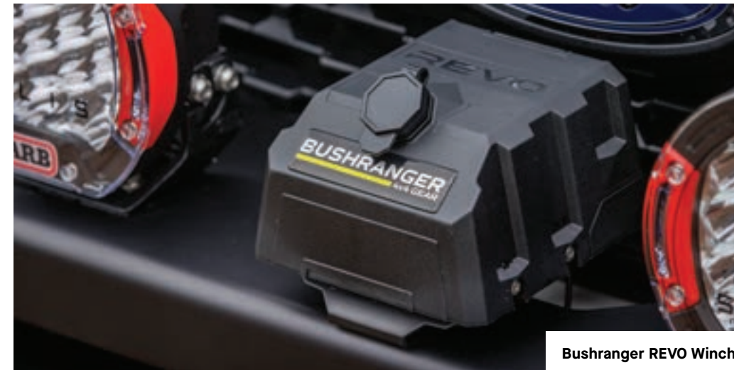
Bushranger REVO Winch