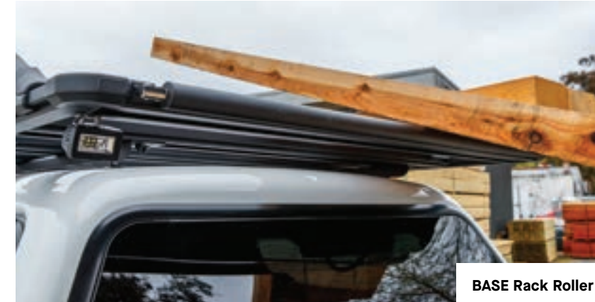
BASE Rack Roller