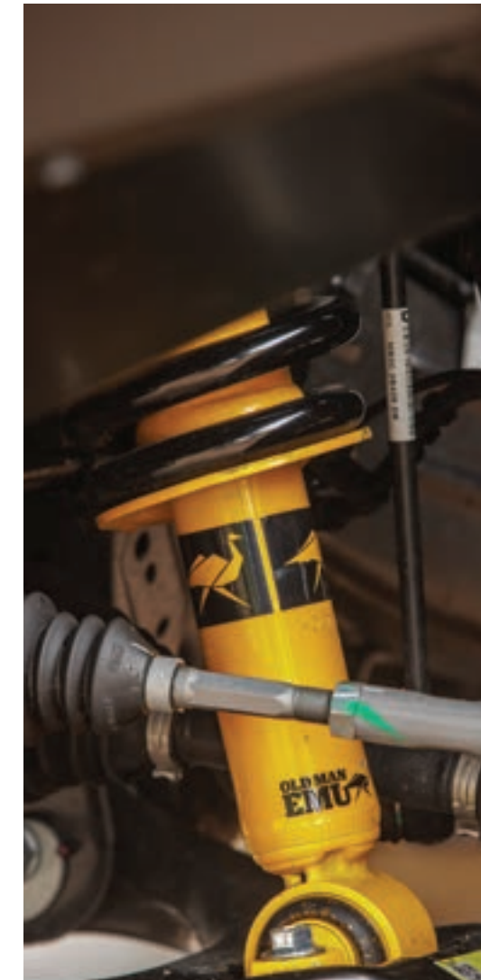
Old Man Emu Nitrocharger Sport Suspension