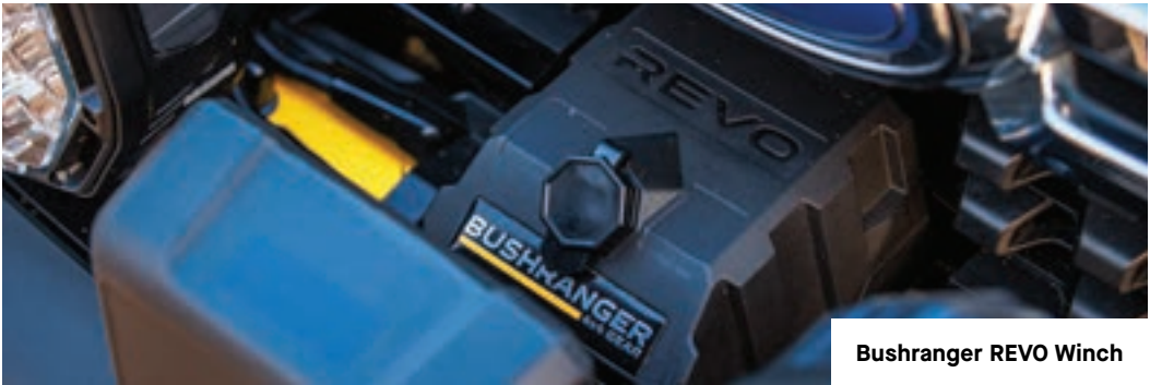
Bushranger REVO Winch