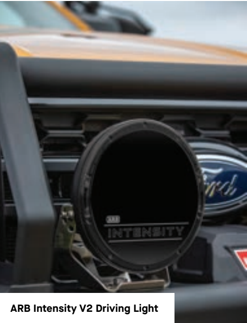
ARB Intensity V2 Driving Light