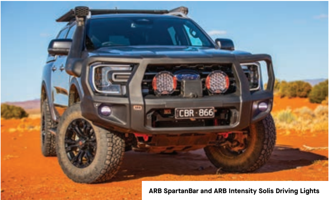
ARB SpartanBar and ARB Intensity Solis Driving Lights