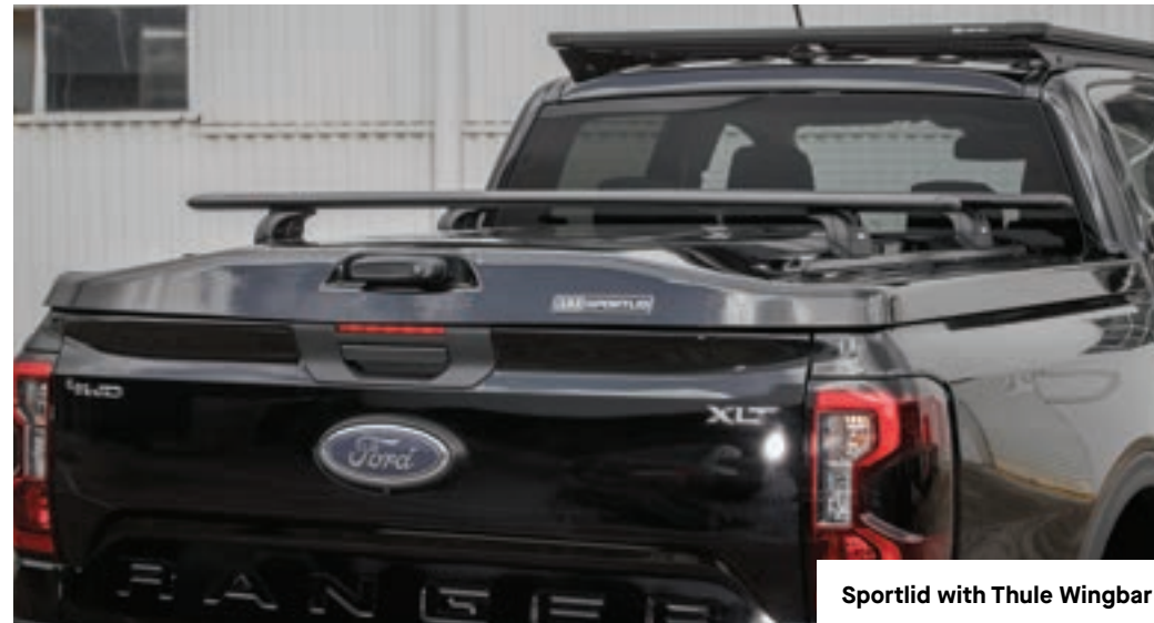
Sportlid with Thule Wingbar