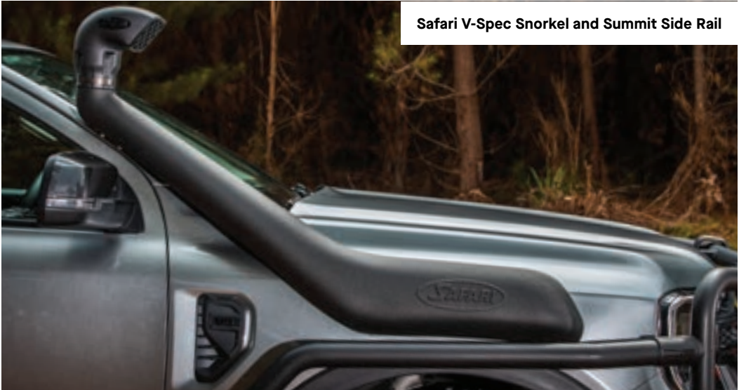
Safari V-Spec Snorkel and Summit Side Rail