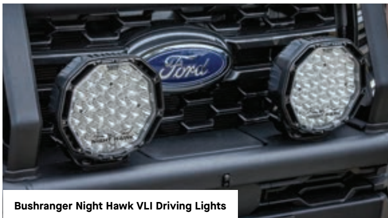
Bushranger Night Hawk VLI Driving Lights