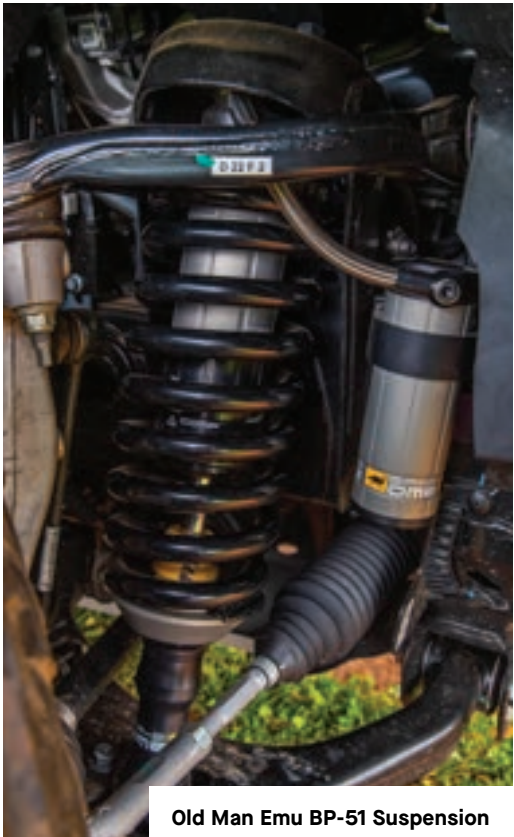
Old Man Emu BP-51 Suspension