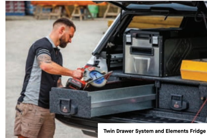
Twin Drawer System and Elements Fridge