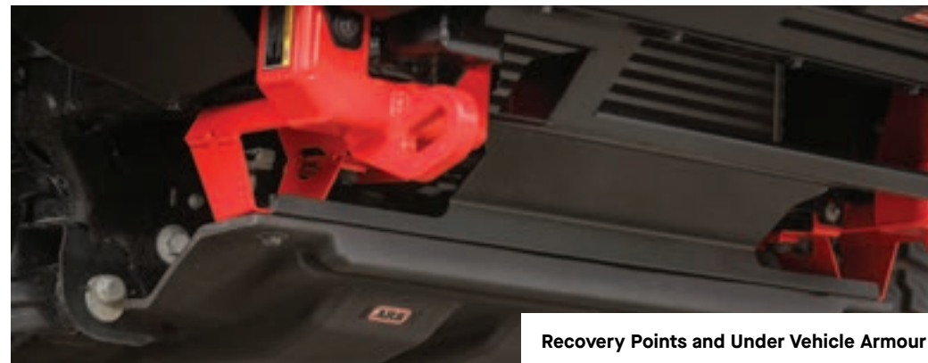
Recovery Points and Under Vehicle Armour