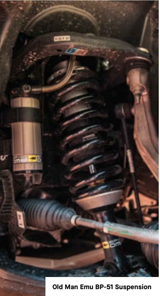
Old Man Emu BP-51 Suspension