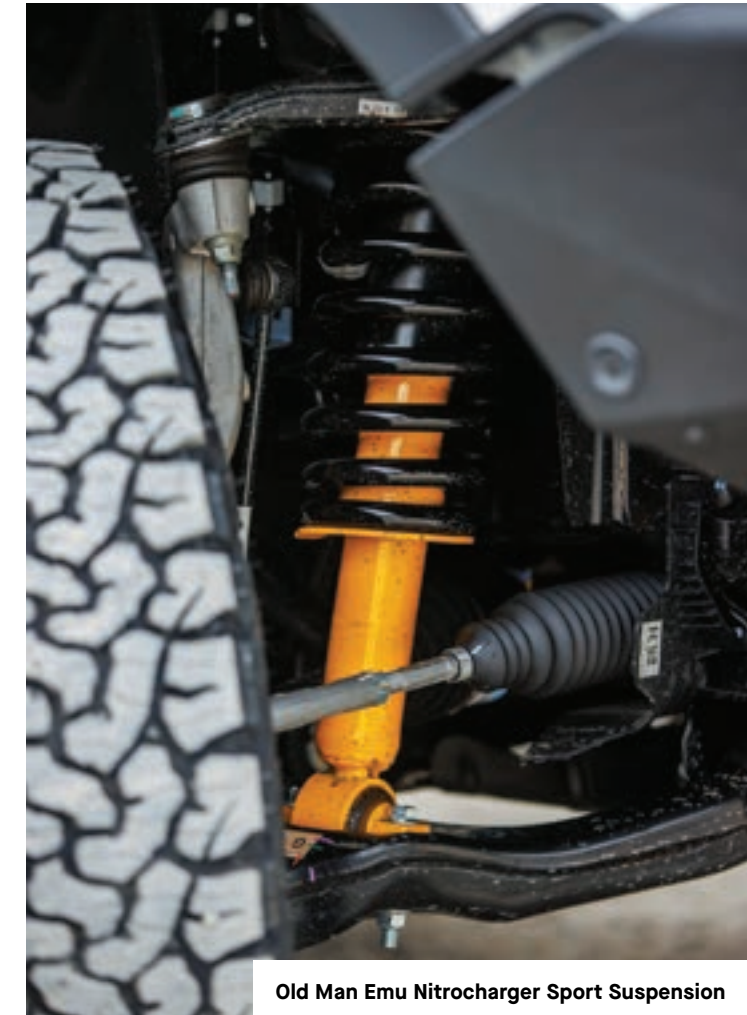
Old Man Emu Nitrocharger Sport Suspension