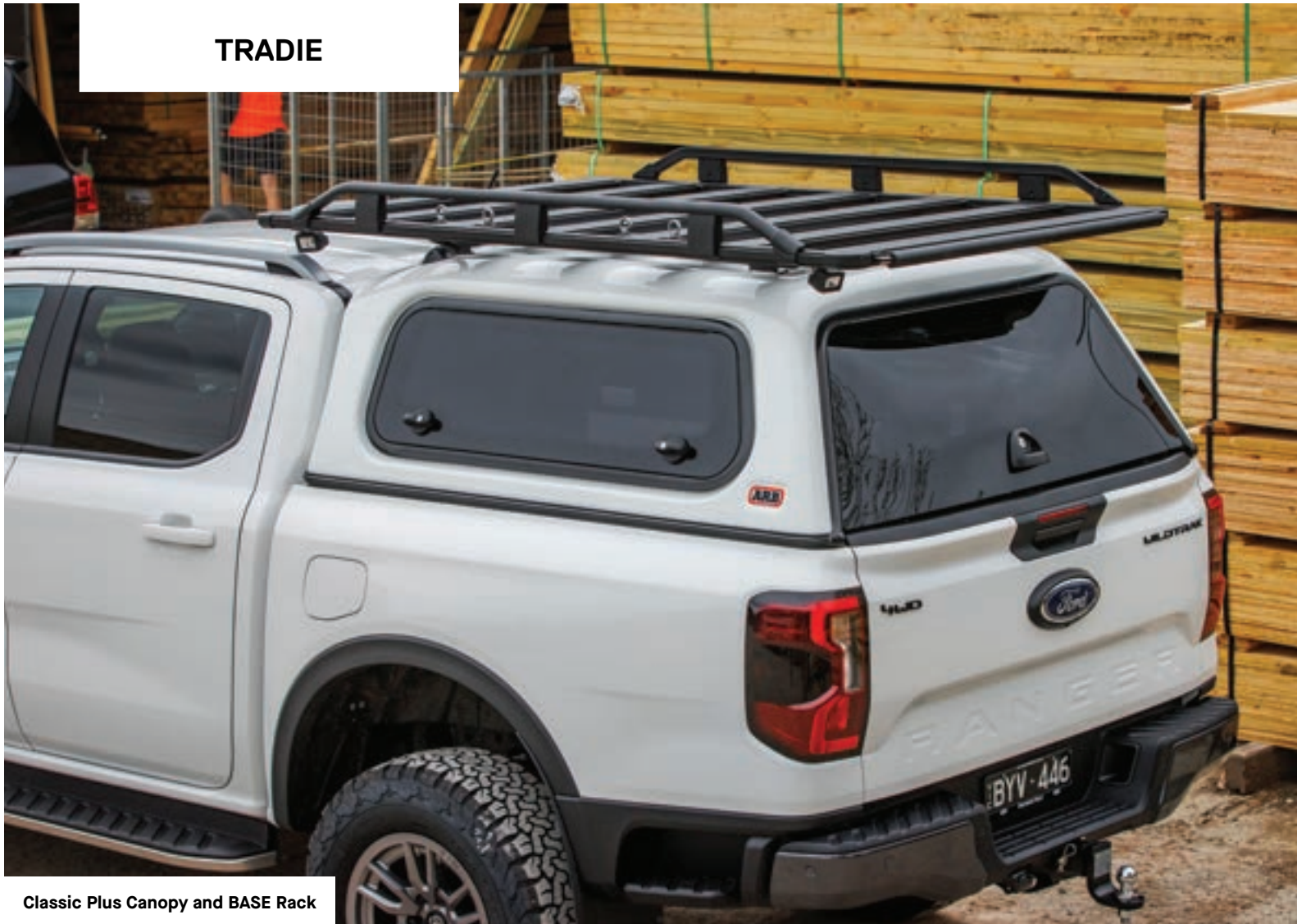
Classic Plus Canopy and BASE Rack