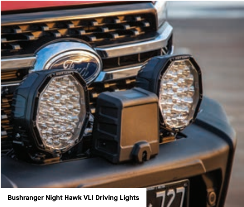
Bushranger Night Hawk VLI Driving Lights