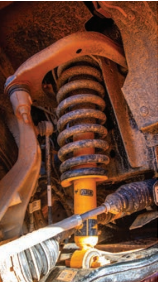
Old Man Emu Nitrocharger Sport Suspension