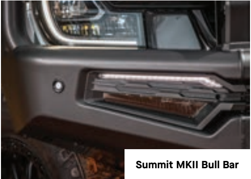
Summit MKII Bull Bar