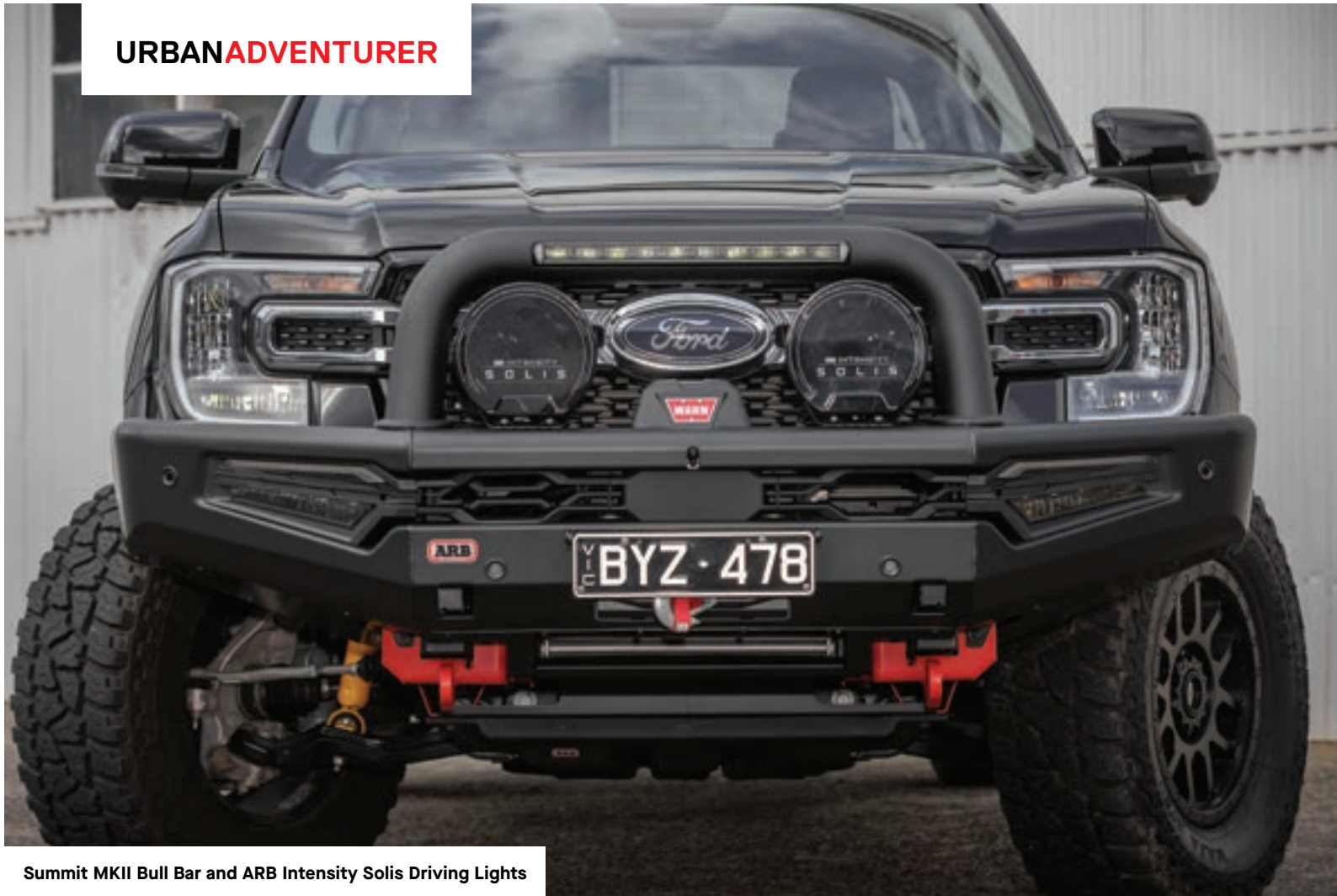
Summit MKII Bull Bar and ARB Intensity Solis Driving Lights