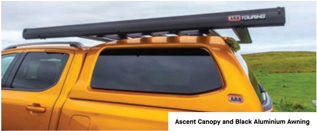
Ascent Canopy and Black Aluminium Awning