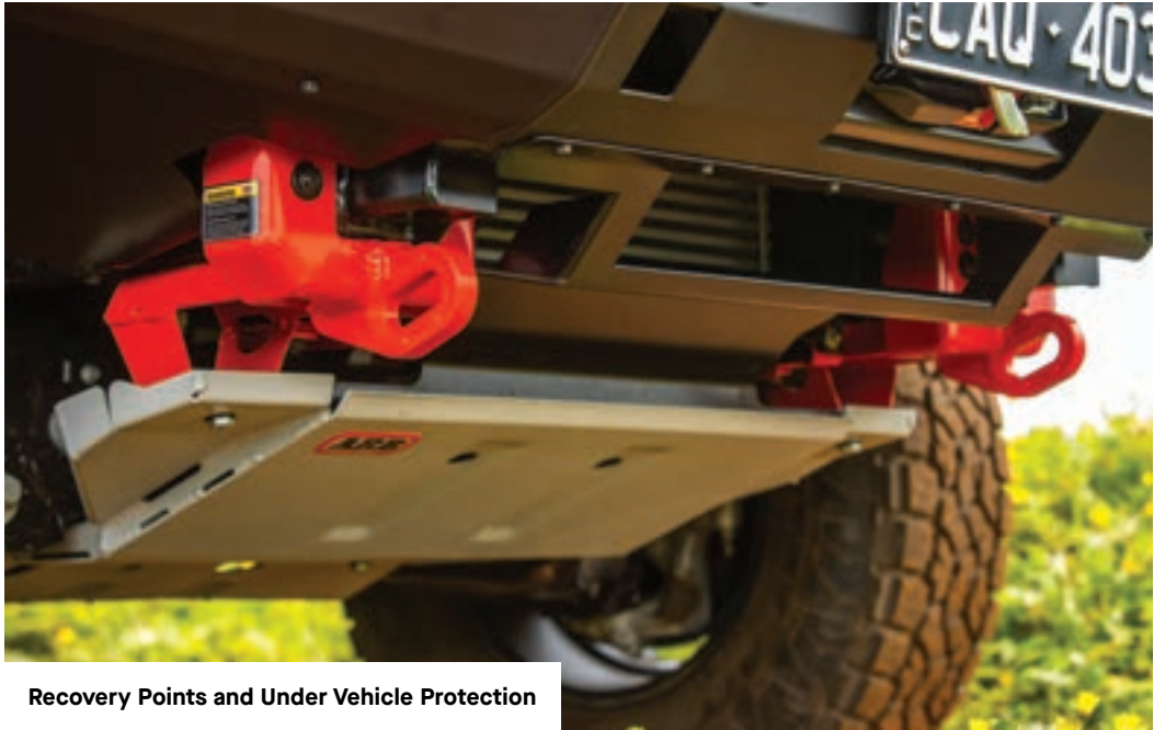
Recovery Points and Under Vehicle Protection