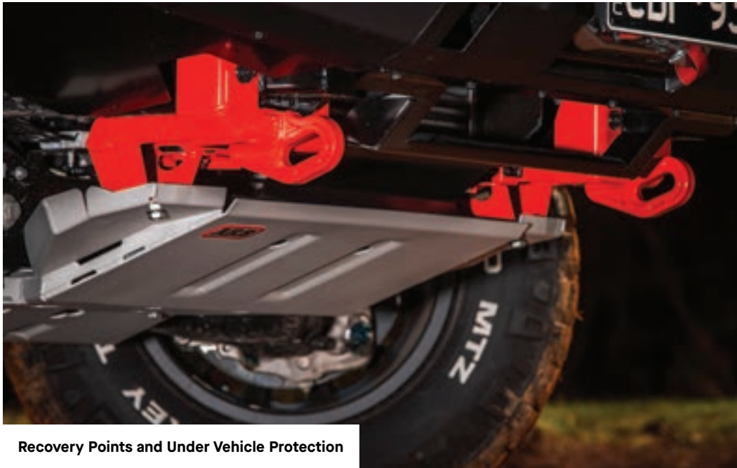
Recovery Points and Under Vehicle Protection