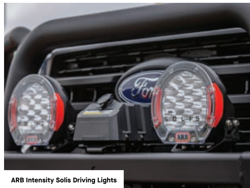
ARB Intensity Solis Driving Lights