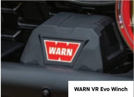
WARN VR Evo Winch