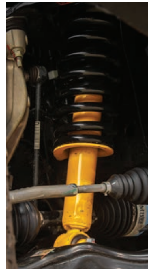
Old Man Emu Nitrocharger Sport Suspension