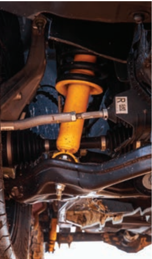
Old Man Emu Nitrocharger Sport Suspension